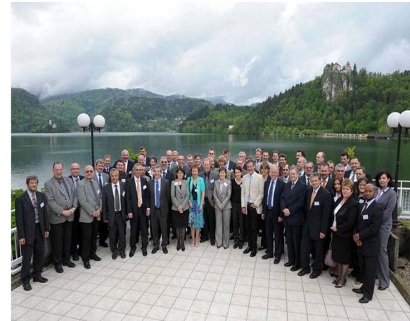
26th WELMEC Committee meeting 6/7 May 2010 Bled, Slovenia

WELMEC's mission is to develop and maintain mutual acceptance among its members and to maintain effective cooperation to achieve a harmonised and consistent approach to the societies needs for legal metrology and for the benefit of all stakeholders including consumers and businesses